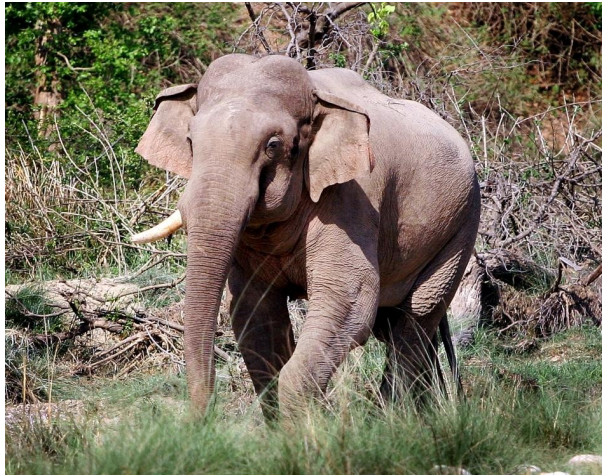
Figure 2. Bull elephant (Ganesh) in musth, trying to approach a cow elephant in Chilla forest.

munja ), growing in the dry river bed. After a while other group members escaped from there. I had enough time to record the moment in a video camera and capture the images with a still camera.