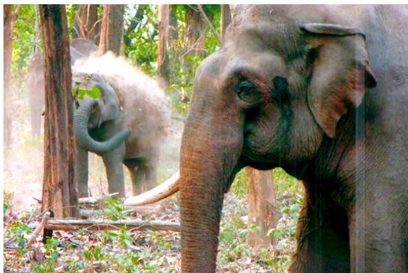
Figure 3. Tusker during musth in Chilla forest.

Bull elephant was making efforts to impress the cow through uplifting his trunk, throwing mud in the air, making noise and wandering here and there maintaining a distance of nearly 50 meters, but cow elephant was not responding to him (Figure 3). Sometimes, bull had made attempts to push up the infant to abduct away, but cow in every attempt moved together with the infant and responded badly by chasing-off him. This process continued for nearly two & half an hour. During this course, bull elephant charged our vehicle two times, however, all of these attempts were mock charges in which he ran behind us up to 100-150 meters and after every charge, he returned back quickly to the individuals and started wandering there. We were amazed to see this behaviour of bull elephant and ultimately at 18:40 h, bull had made an attempt to mount over the cow to copulate but cow had not supported the act. For next 25 minutes, bull continued these false attempts. Unfortunately, at 19:05 h, sunlight became mild, and we were unable to see the ongoing with our naked eyes and therefore, returned back from the spot/forest. Is this incident a conflict for mating/courtship or the characteristics feature of musth; some of these questions became a puzzle for me for more than a week.